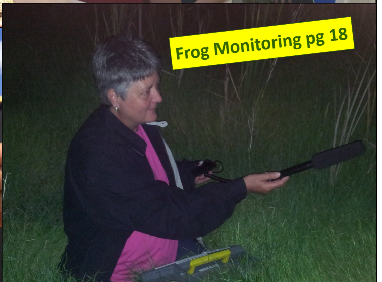
Frog Monitoring pg 18