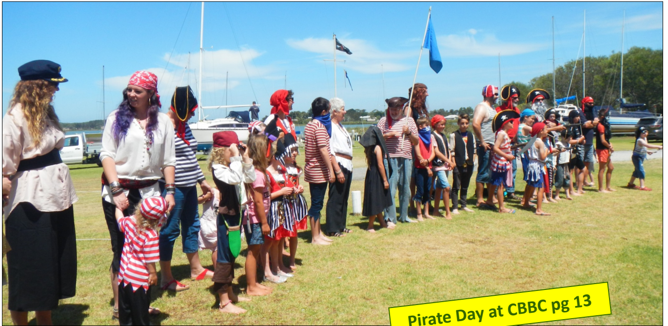
Pirate Day at CBBC pg 13