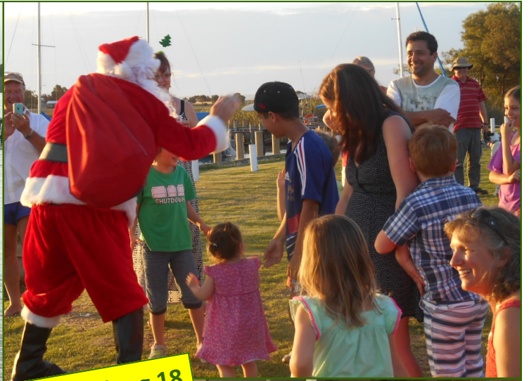
Christmas at the Boat club pg 18