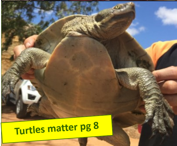
Turtles matter pg 8