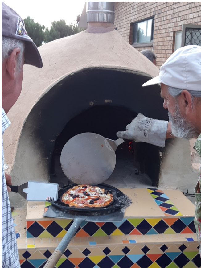
The new pizza oven (and pizza chefs) producing fabulous pizzas