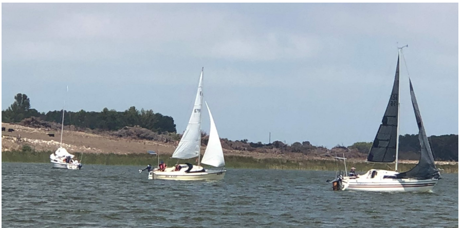
A less mellow 'Rat Race' moment.