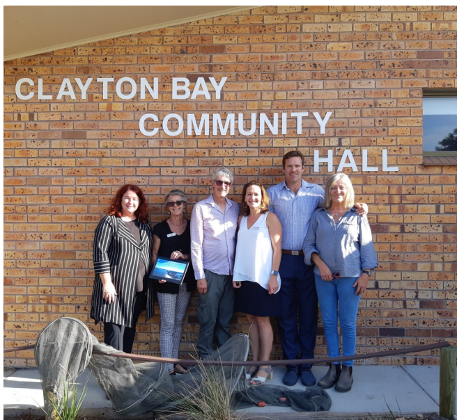
Federal Minister for Environment, Melissa Price, Georgina Downer and community members during their visit to the Southern Bell Frog Breeding Centre.