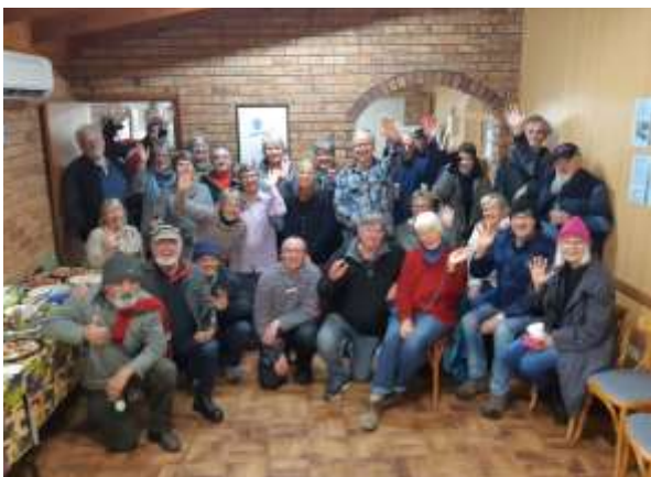
Some of the amazing volunteers who brought you the Winter Solstice Bonfire enjoying a celebratory pizza from the new pizza oven.