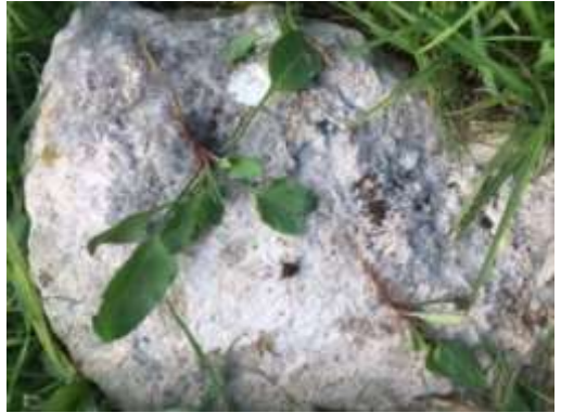
Three-corner Jacks as they appear at this time of year

Three-corner Jacks, a nasty declared weed, has started its new season germination around Clayton Bay. There are infestations along street verges and parking areas around the Caravan Park.