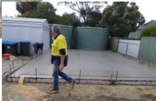
Watch this space!