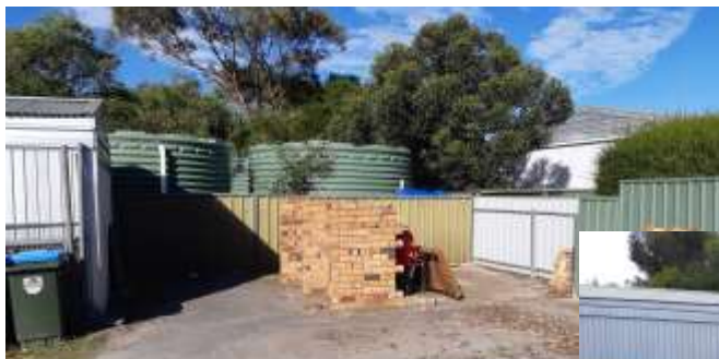
Slab's gone down