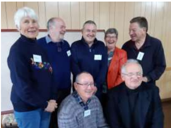
The new 2019 Committee