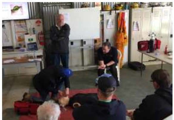
Attendees at the recent Advanced Resus course at Clayton Brigade