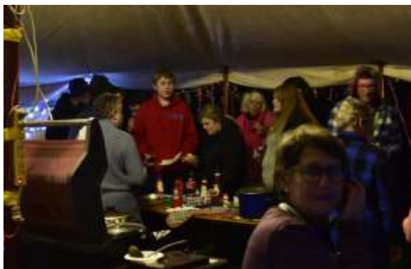
The volunteers hard at work at the bonfire.