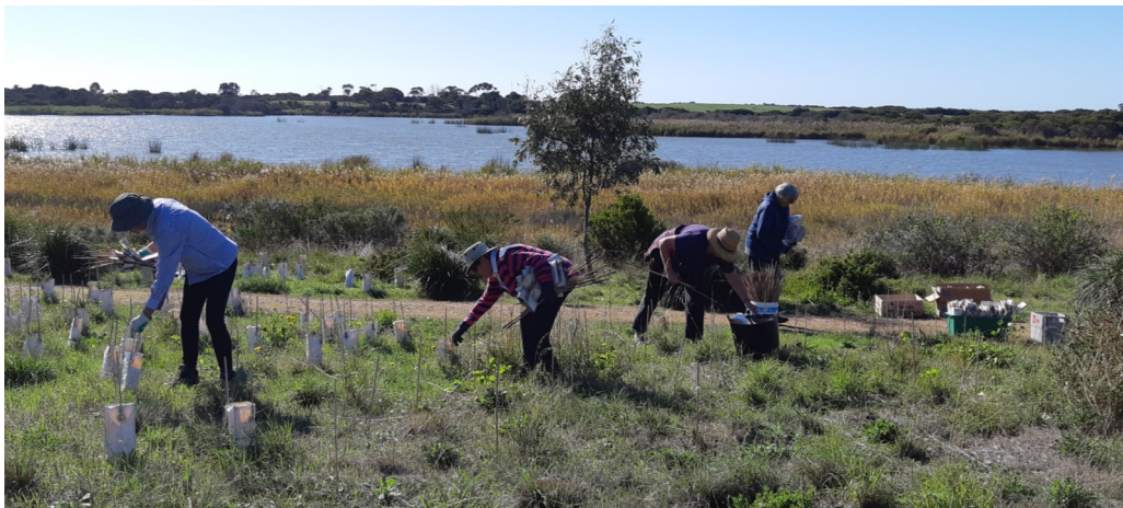
Above: Volunteers removing plant surrounds and stakes. See page 12