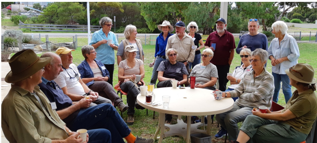
Clayton Bay Chronicle— Autumn 2020