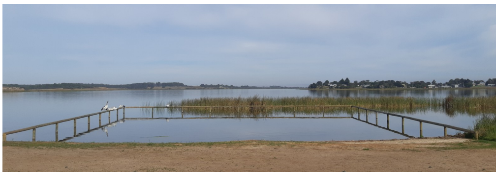
Above & Left: New swimming beach and shelter overlooking the new small craft launch area.