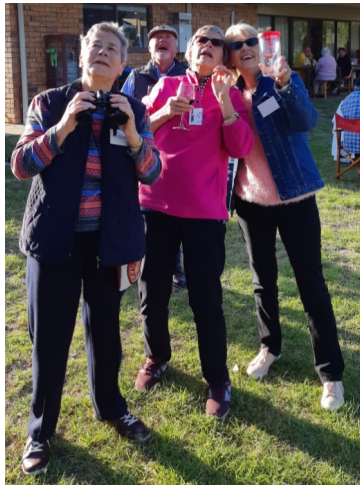
Above: "What are we looking at?" Pizza night fun.