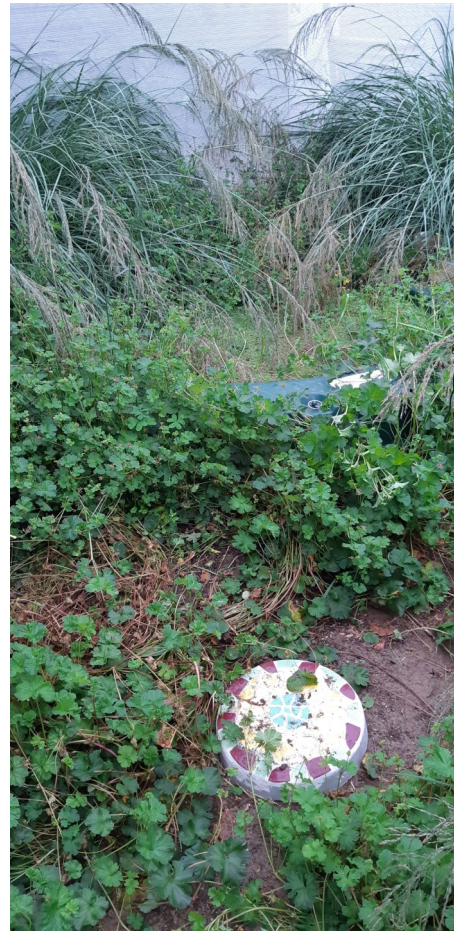
Right: Frog enclosure See page 17