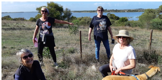
Below: Hall Grounds Clean Up Volunteers. See Page 11