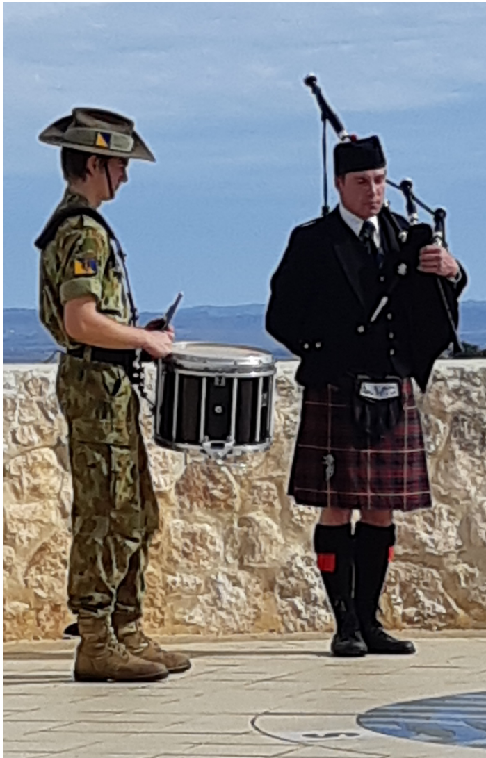
ANZAC Day: New stobie pole at Old Clayton (right). Bagpipe tribute , see page 23