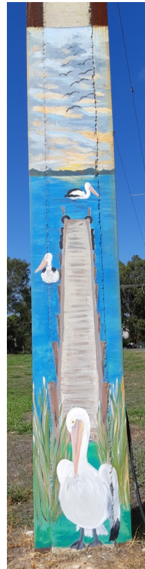
New stobie poles around town. Have you seen them? See Page 17