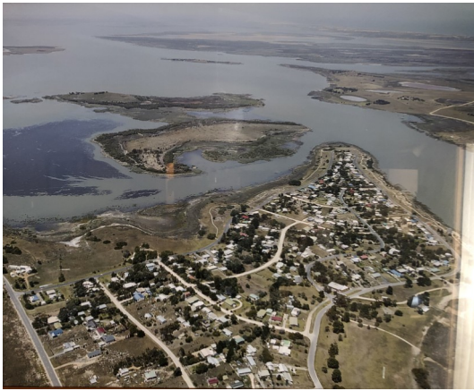
Above: For Sale. See page 17